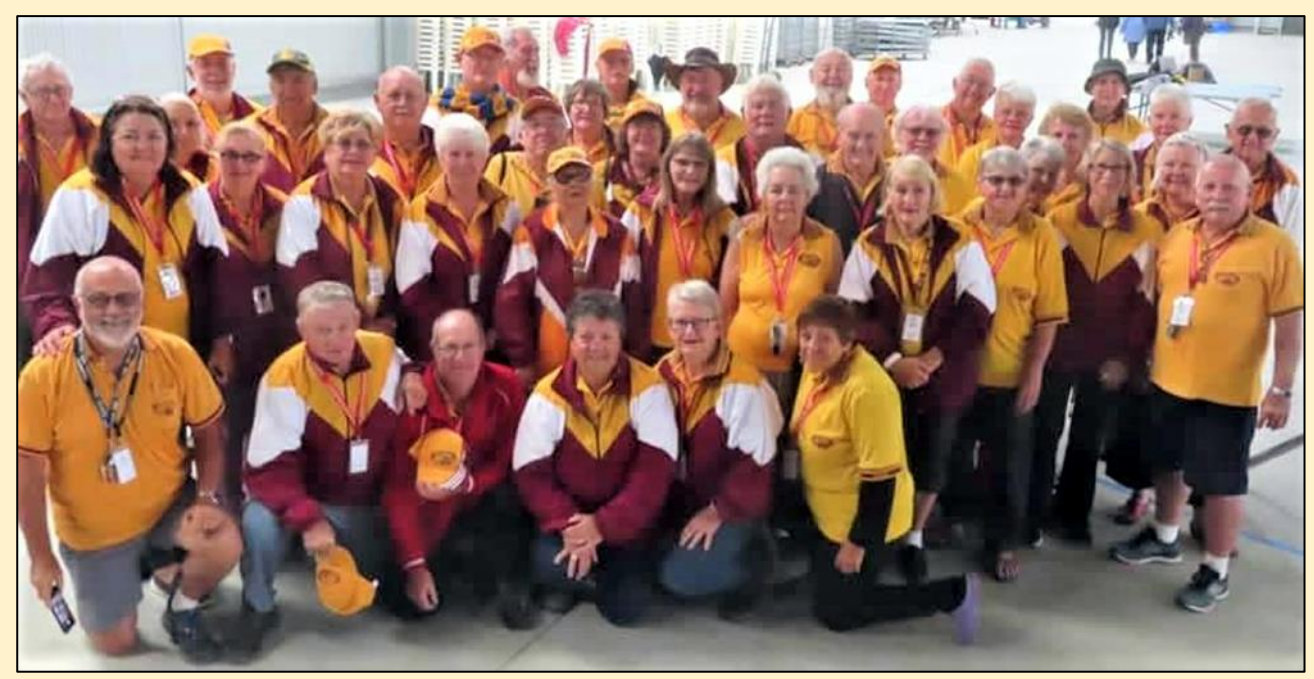
OCC members who attended the National Rally in Albany in 2019.

What a year 2020 was for the whole world! The COVID-19 pandemic very quickly spread around the world, with many deaths and leaving economies worldwide stricken. Many countries were casual about protecting their citizens, but in Australia, our federal and state governments went to great lengths to protect our health and our economy. As a consequence, we avoided much of the worldwide tragedy.