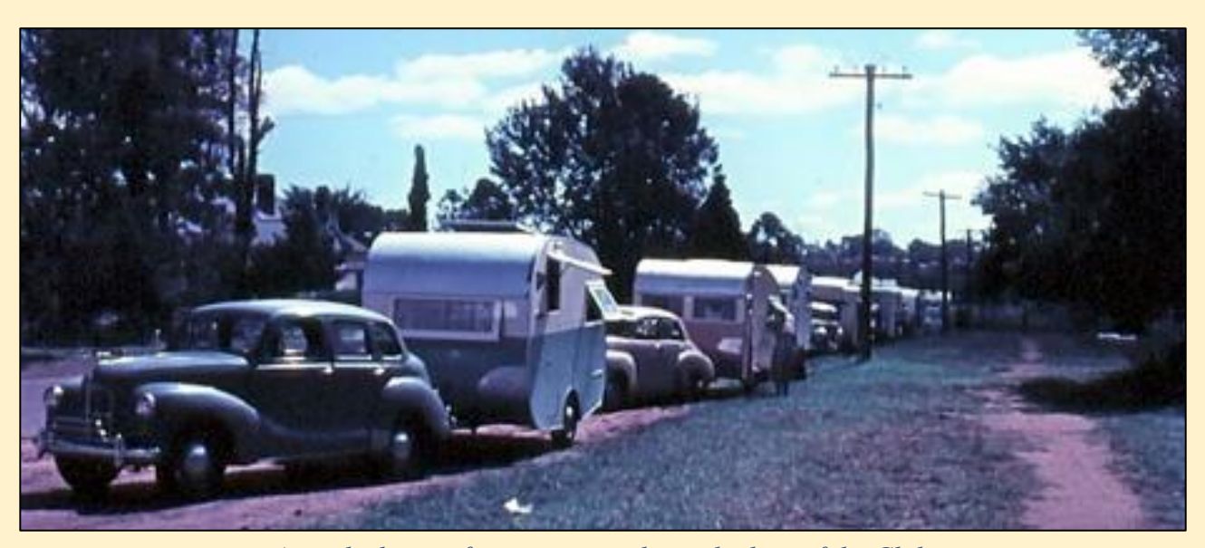
A roadside stop for a cuppa in the early days of the Club.

The year 2009 will be a significant one for the Club - not only will we celebrate our 60<sup>th</sup> birthday but will also be one of the host clubs for the State Rally to be held in Pittsworth. So ... here's looking forward to a busy year with lots of fun times to be had.