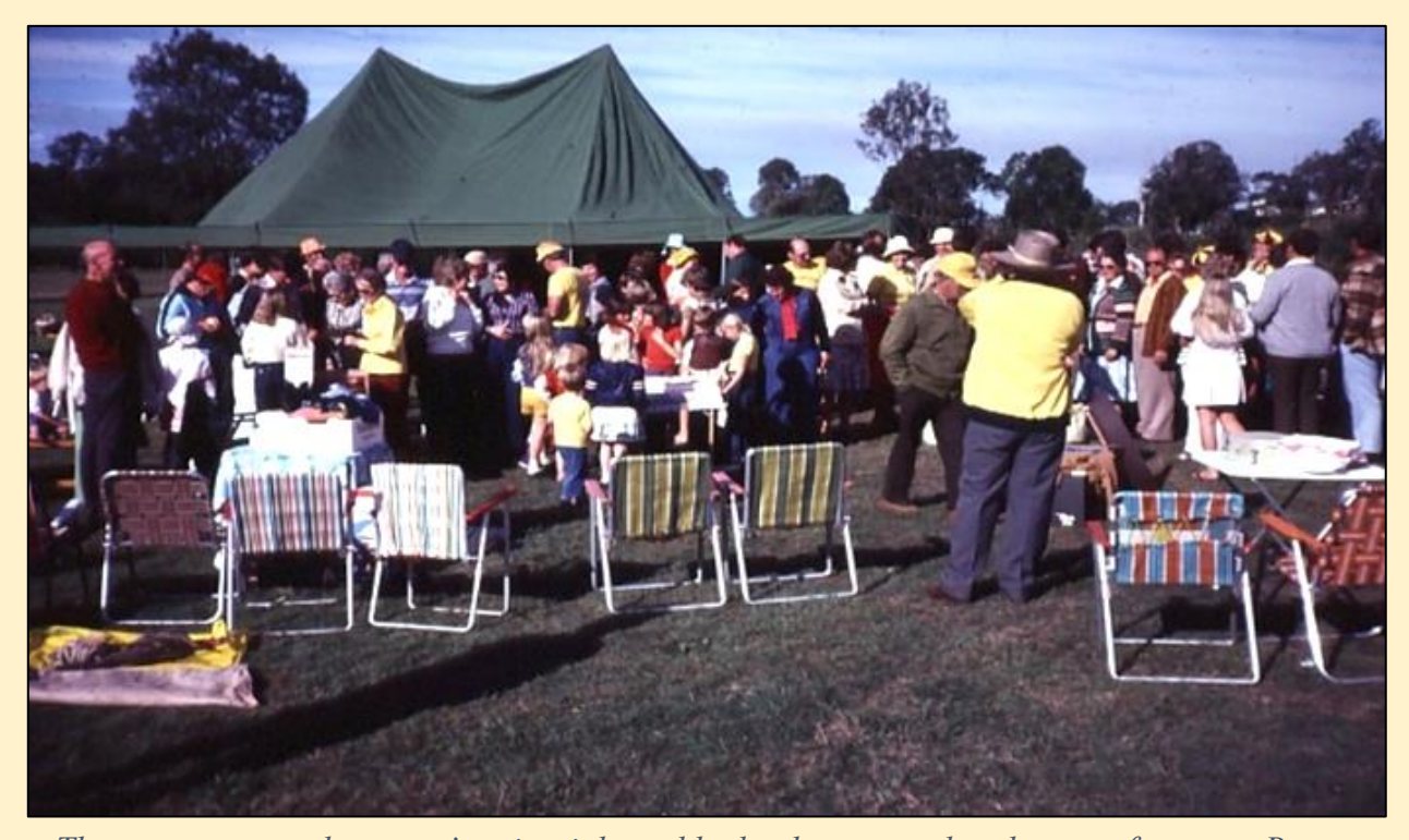
The new marquee that wasn't quite right and had to be returned to the manufacturer. But we still celebrated with a cake!