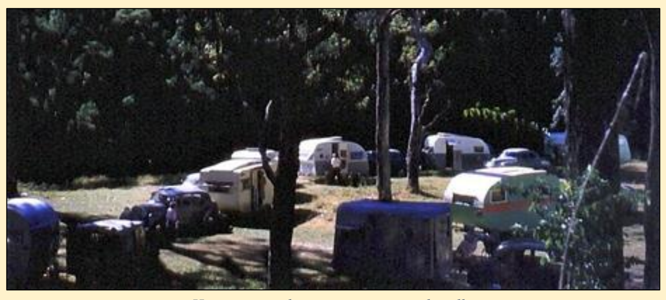
Home among the gum trees - an early rally.