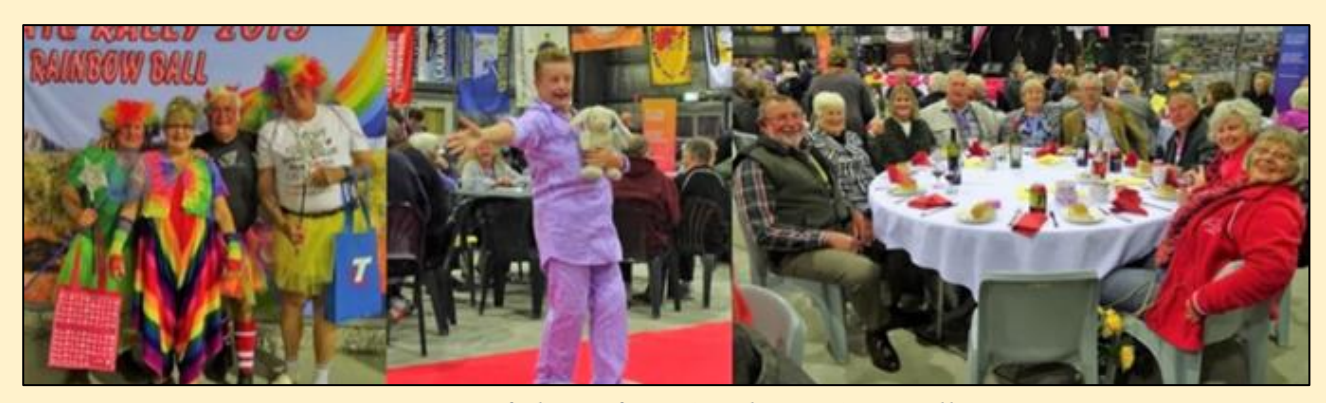
An array of photos from Stanthorpe State Rally.

at first sent by post (or 'snail mail'). Then by 2010, QCC had commenced despatching them by email, to those who wanted it so. In the ensuing years there was a great drive to encourage members, and others, to receive it by email rather than post. By late 2017 only a very few bulletins were still being despatched by post; they were mostly emailed.