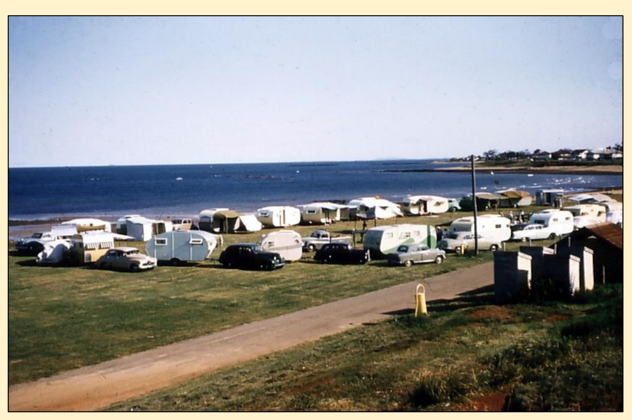
An early rally with vans in a circle as was the custom when the club was this size.