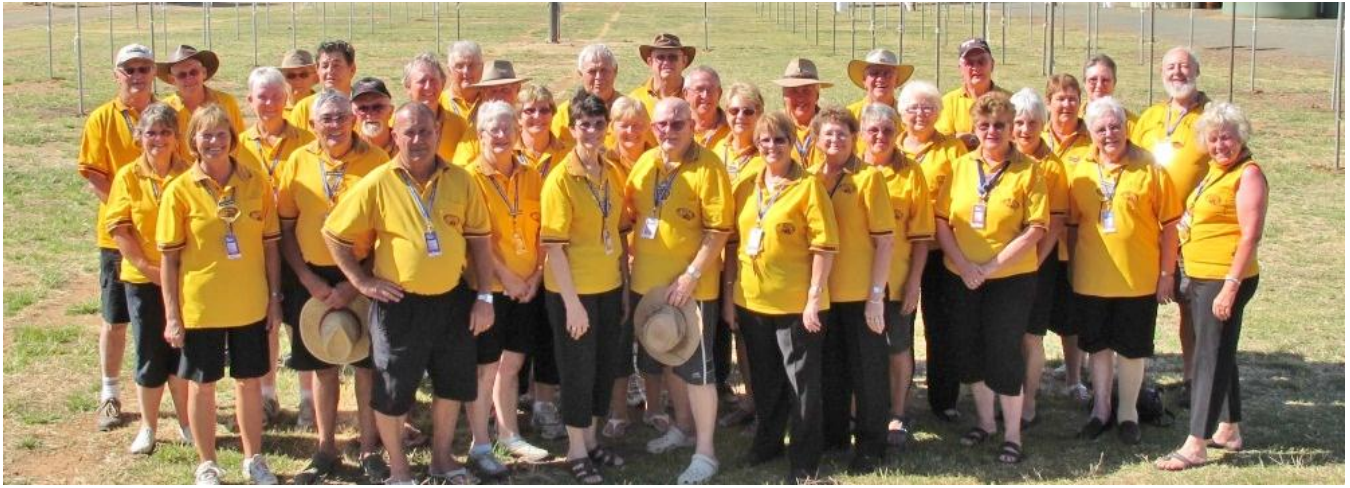
All of the QCC National Ralliers