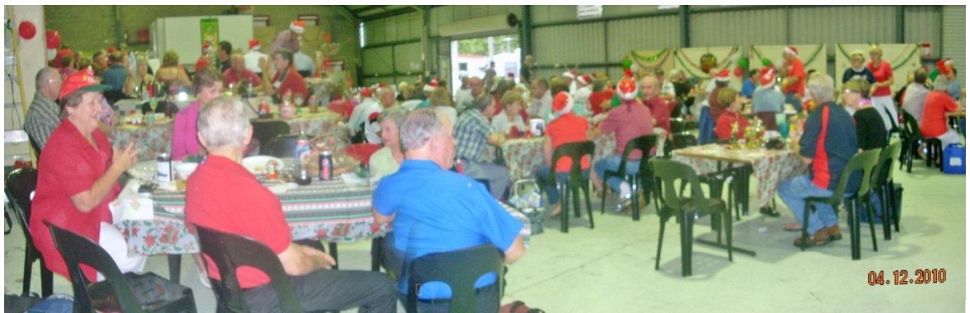
Our Christmas Ralliers