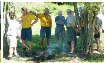
Right shifty looking bunch