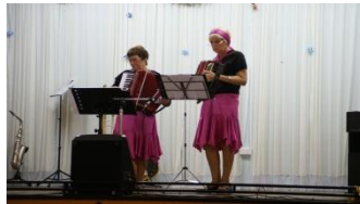
The Gypsy Gals