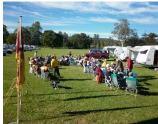
Hungry Brekkie horde