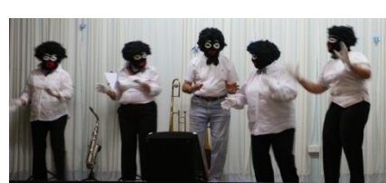
The Mystery minstrels