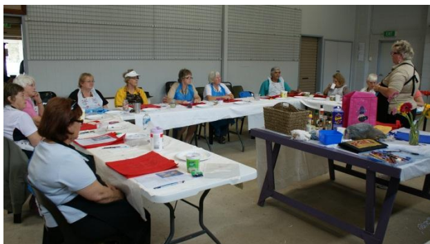
Crafty Ladies (and one bloke)