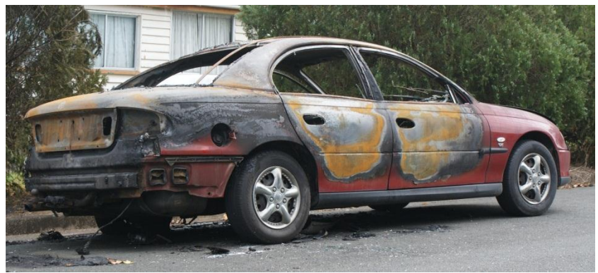
THE RESULT!!! (side street opposite the showground)