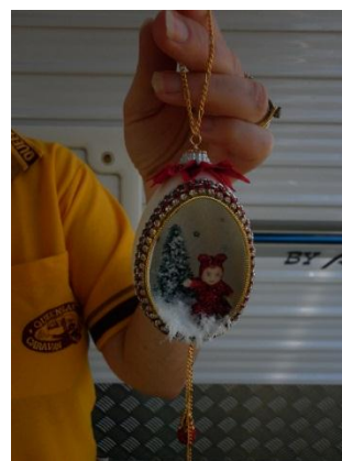
Cute bunny in gogole

Seminars These were many and varied including mufflers, 12 volt, CRP, water filters, towbars, satellite phones, public trustee, correct rollout awning positioning and vehicle preventive maintenance. All were reasonably well received.