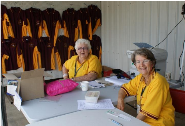
The Hard Sell !!