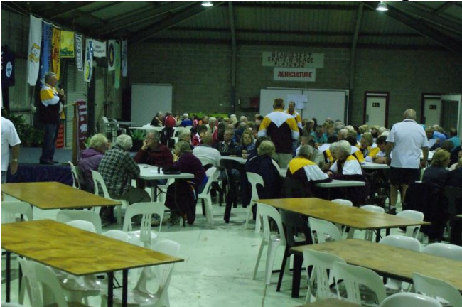
Trivial Mob !

Wednesday saw the trivia night in action. The game was well organised ,if not a trifle rushed. No major disputes arose,although muted rumbles of discontent could be heard.Lets face it,one is entitled to grumble a bit when the old sheep farm is at risk !!