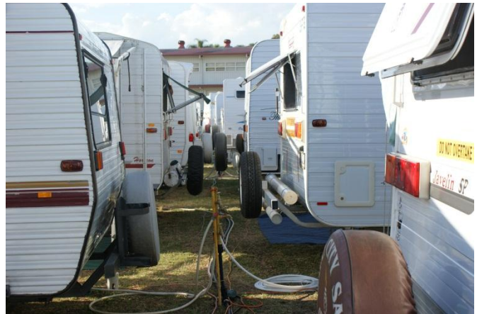
Back to Back