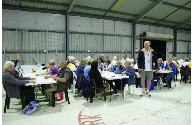
Full House !!

Friday night, some of us we were introduced to a new version of bingo ,played with a standard deck of playing cards. It was easy enough to pick up and all enjoyed it . Again, a trifle rushed. I for one, got the impression that the organisers had somewhere to be in a hurry!!