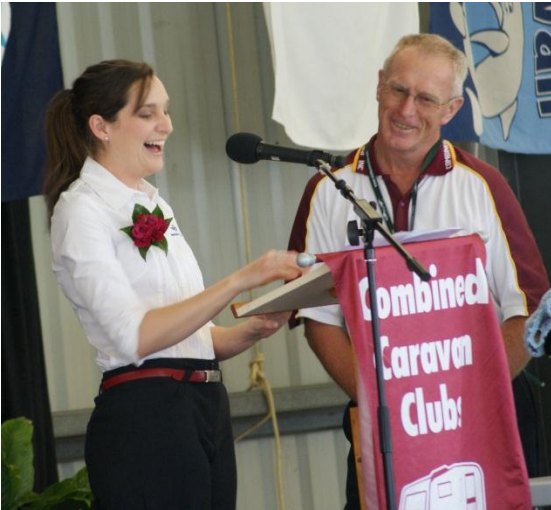
RFDS receiving $7500 Cheque