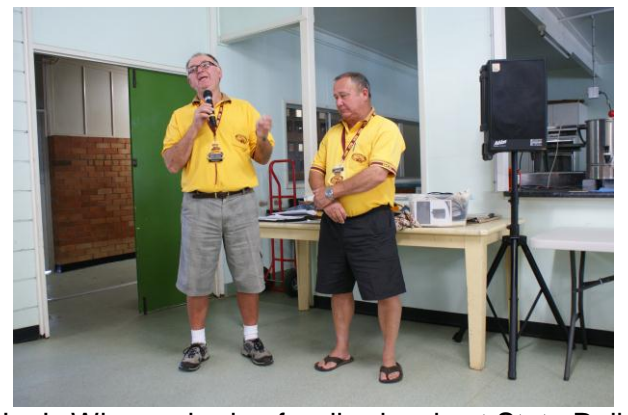
lan's Winners badge for disc bowls at State Rally