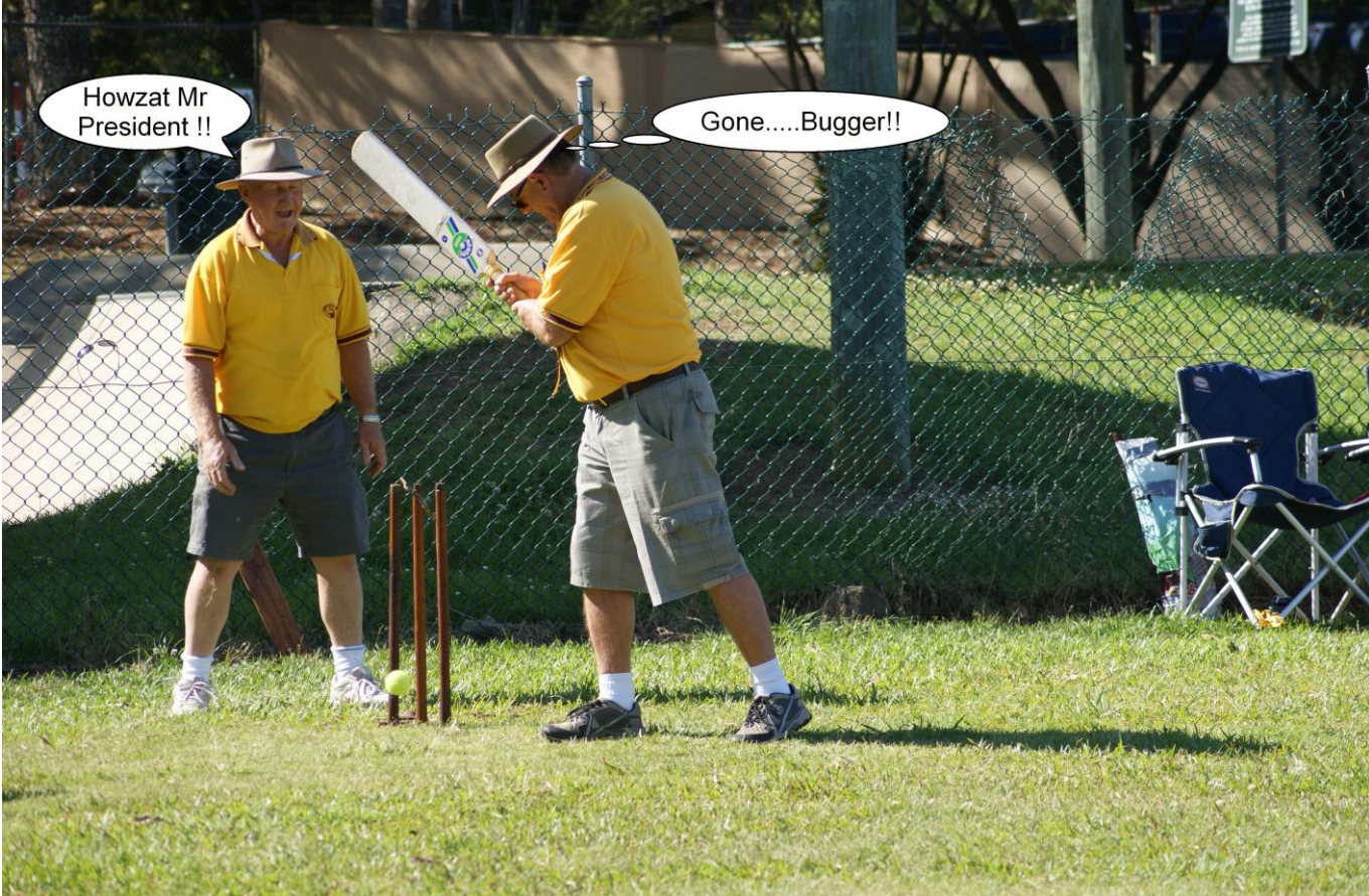
He never offered up a shot !!!!!!!!!!!!