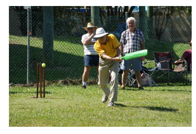
The Big Event,-- GLAMOUR, GLITZ and GLITTER

Fine, warm, weather guaranteed an excellent turnout for the occasion. Each elegantly dressed couple was photographed at the entrance on arrival. I thought this was a wise move 'cos after an hours galloping around the dance floor, most people didn't look quite as pristine as when they arrived. Whoever was supposed to be door security didn't do a very good job, as a rather unsavoury looking character, closely resembling "Onslow", Mrs Buckets grotty Son-in-Law, was seen tripping the light fantastic. (I think he actually won the worst dressed prize!!) The night