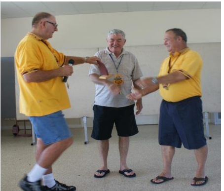
President presents the Trophy.