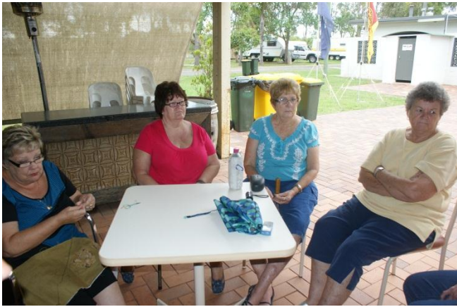
Captivated Jeep Audience !