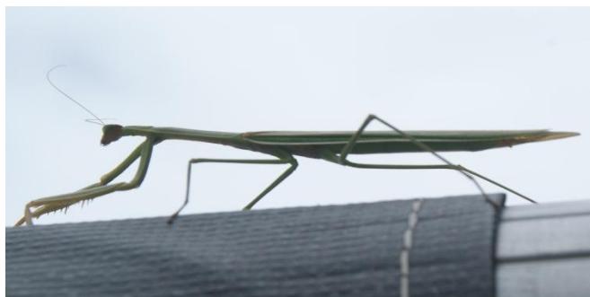
Bit of Crows nest Fauna

Stretton Gardens Retirement Estate Situated on 18 acres of bushland, minutes from Sunnybank Shopping Centre, and local shops. You can experience the resort type lifestyle. It boast a community centre and with additional facilities. Security with peace of mind while you enjoy the best part of your life. Call Ray today on 07 3272 6011