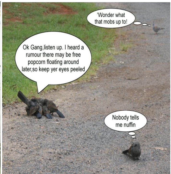
Avian Huddle !!