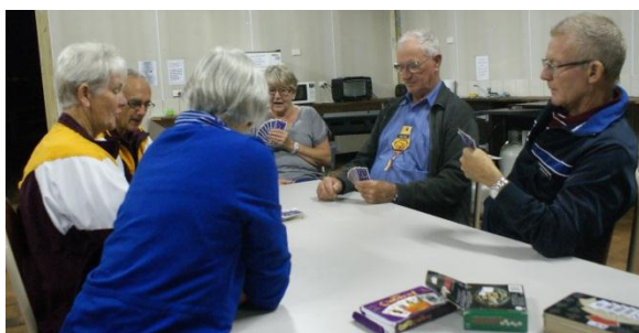
Greed .....I think