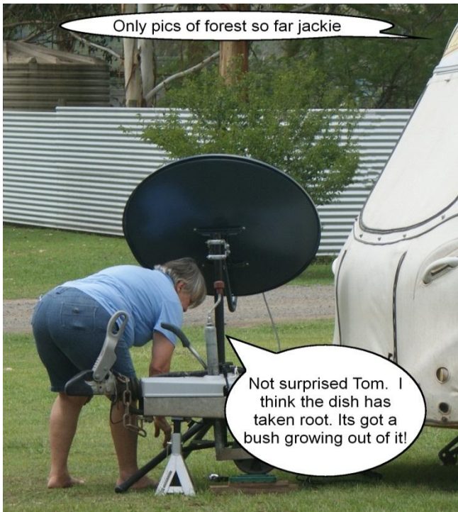
Setting up Woes!