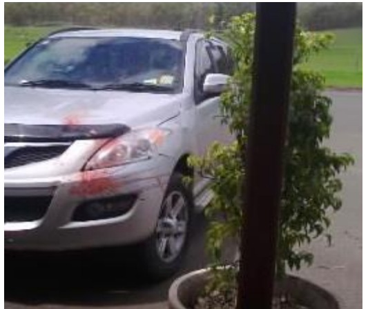
Low flying duck came off worst !