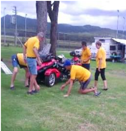
Lucky Lionel, found lost hearing aid !