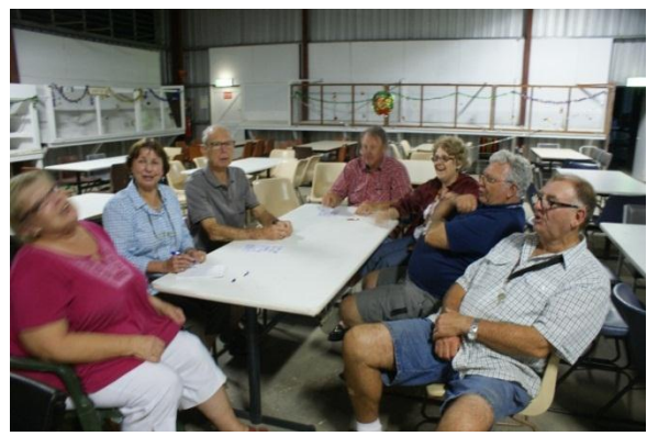
what you looking at mister