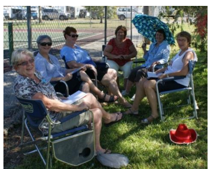
Pooped out Golfer