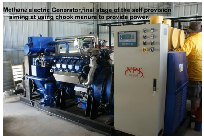
Methane electric Generator, final stage of the self provision aiming at using chook manure to provide power.

Next stop was the Production Line. Suffice to say, mine host Roger Adams, Diplomatically side stepped the inevitable discussion on the merits of different methods of egg production, but did say a couple of words on the debate between caged and free range production and all made complete sense when coming straight from the Farmers mouth.