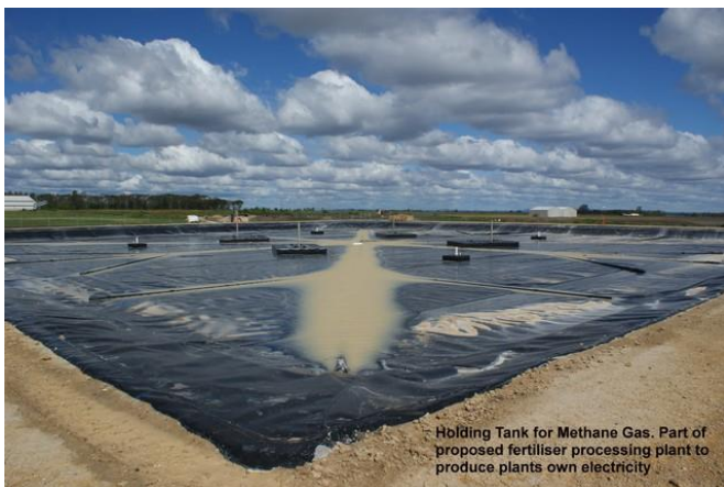
Holding Tank for Methane Gas. Part of proposed fertiliser processing plant to produce plants own electricity