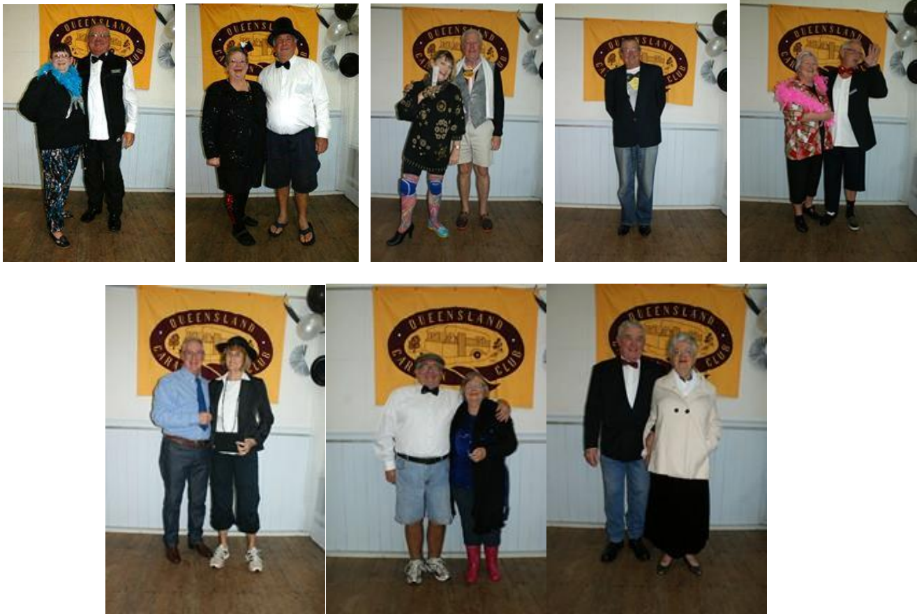
These Photos above will be available as 6x4 prints from myself at the State Rally or Esk.