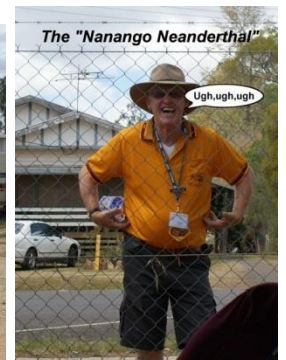
The "Nanango Neanderthal"