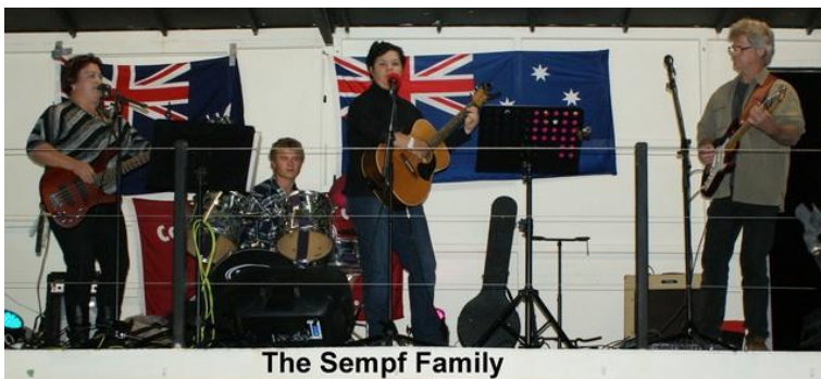
The Sempf Family