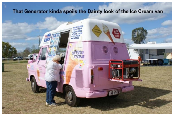
That Generator kinda spoils the Dainty look of the Ice Cream van

Kevin led a rather larger contingent of line dancers than he is usually in charge of through their first session of the Rally. Consequently, following days all had good attendances.