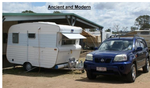
Ancient and Modern