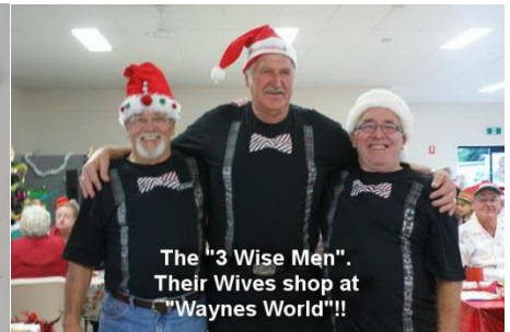
The "3 Wise Men". Their Wives shop at "Waynes World"!!

After Santa had shot through to his next appointment, the Ladies started decorating the tables. there were some cases of overkill as a couple of them had no room for plates etc !!