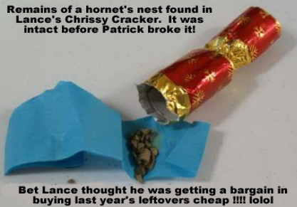
Bet Lance thought he was getting a bargain in buying last year's leftovers cheap !!!! lolol