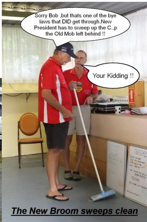
The New Broom sweeps clean

Sorry Members, but just couldn't resist the Quip in the Centre Pic !!!