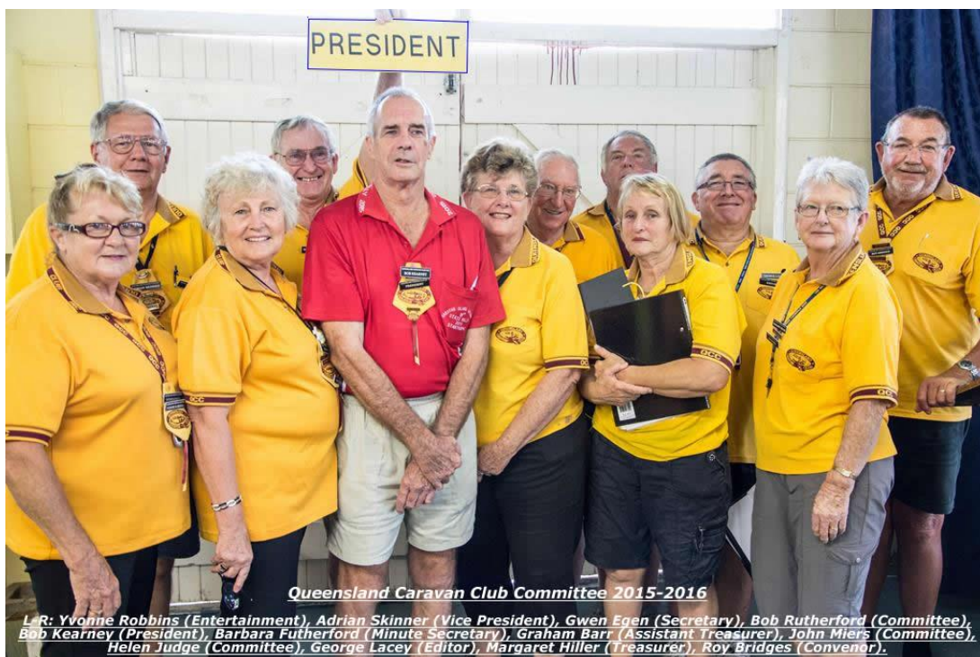
Queensland Caravan Club Committee 2015-2016