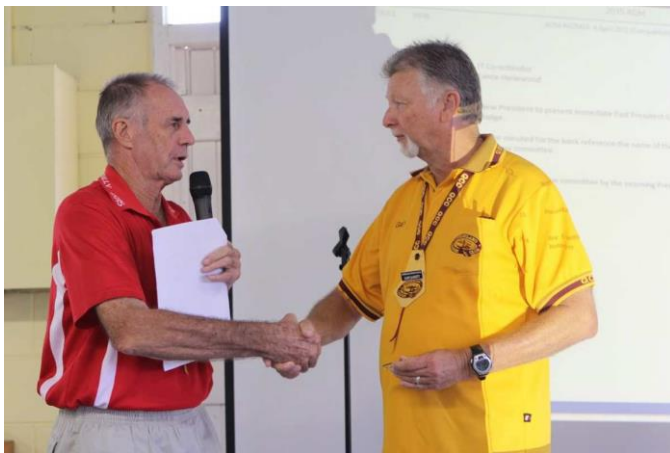
Official handover to new Committee.