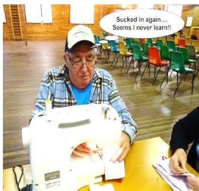
Sucked in again... Seems I never learn!!

I made the mistake of setting up our sewing machine , finishing up labouring in the sweat shop!.....Again !