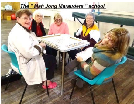
The "Mah Jong Marauders" school.

Friday dawned just as dismal. The usual hectic pace of arrivals was rather subdued as a lot of Members decided to give this Rally a miss. As it was, many took the precaution of pulling in their awnings owing to rising winds.....Of course they couldn't know in advance what the weather was really going to do !