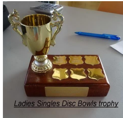
Centre & Left: