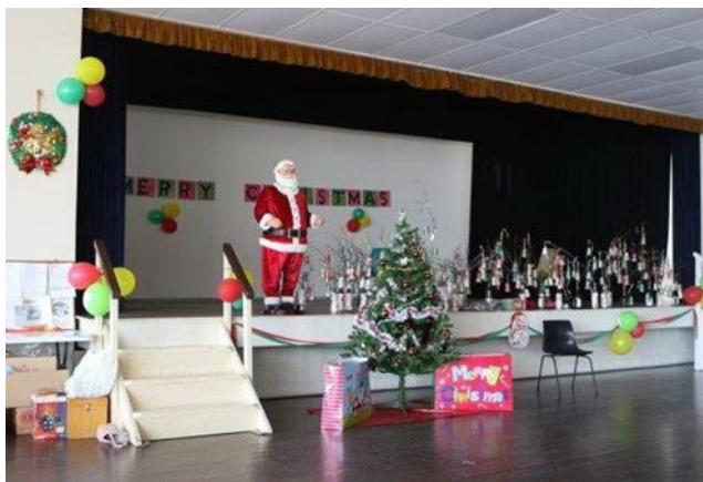
Nice stage set up