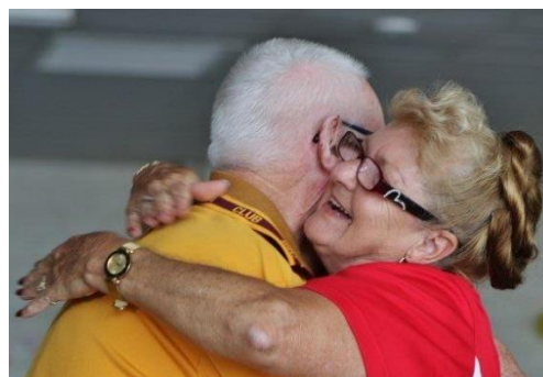
Great News !!