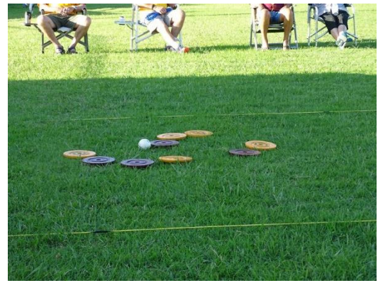
Right: The Finish !

A great afternoons entertainment. Thanks Fellas & Fellettes!!