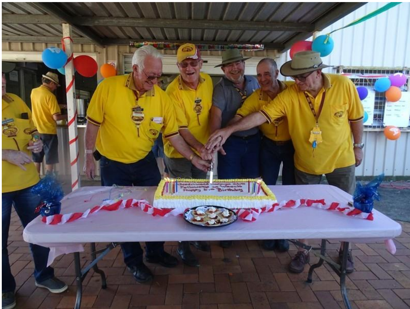
The Birthday Cake was Cut by 5 Present, Past Presidents !!! Sort that one out if ya can !