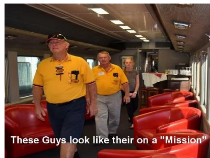
These Guys look like their on a "Mission"