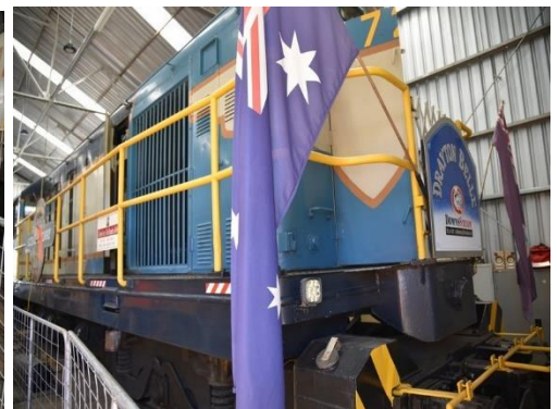
The Exhibition had a good assortment of Restored and partly restored old Rolling stock, from Basic stuff down to "Downs" like Luxurious. And of course some weird and wonderful artefacts as all these places seem to have!!