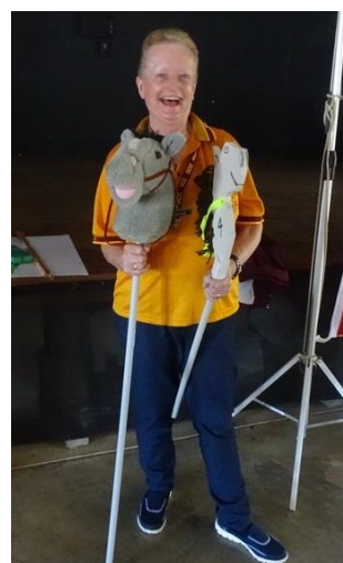
Ann-Shakee Shamrocks Greens