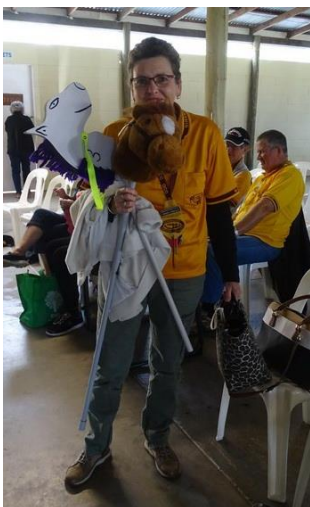
Nerida-Chooks & Chicks Yellows