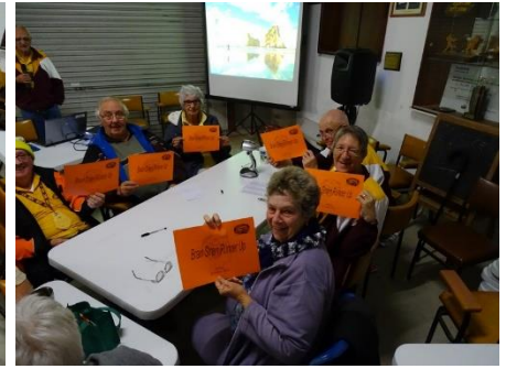
Runners up as well !!

We had an Equine event on the Oval Sunday and they had a canteen set up so heaps of members ,including myself, enjoyed a cooked breakfast for $8.