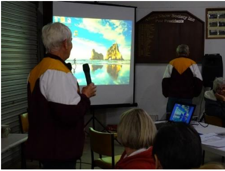
Top nights entertainment.