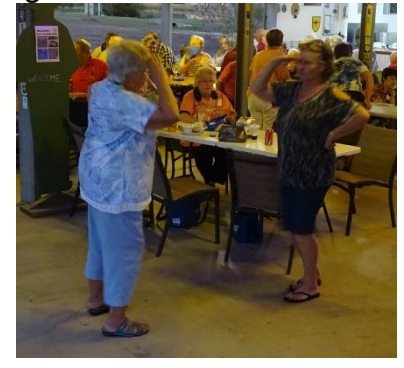
Even a few folk dropped in to see what was going on..... including a real, live, "Drop Bear"