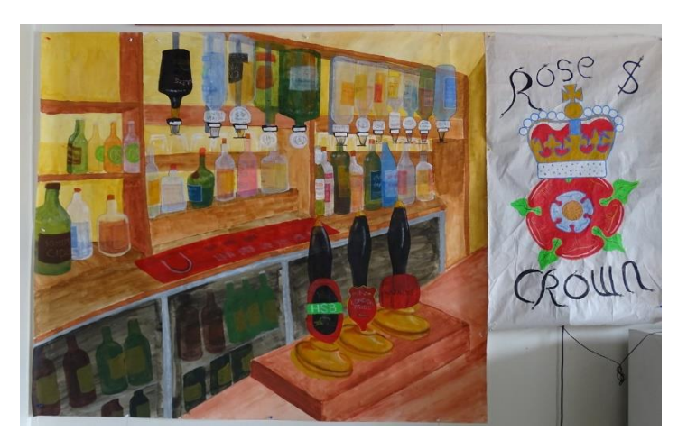
Right, was a Birthday celebration of some description, but I never did find out whose!

The meal preparation hit a couple of hiccups, as is usually the case catering for crowds this size,