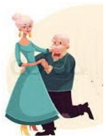
Olde Tyme Gear