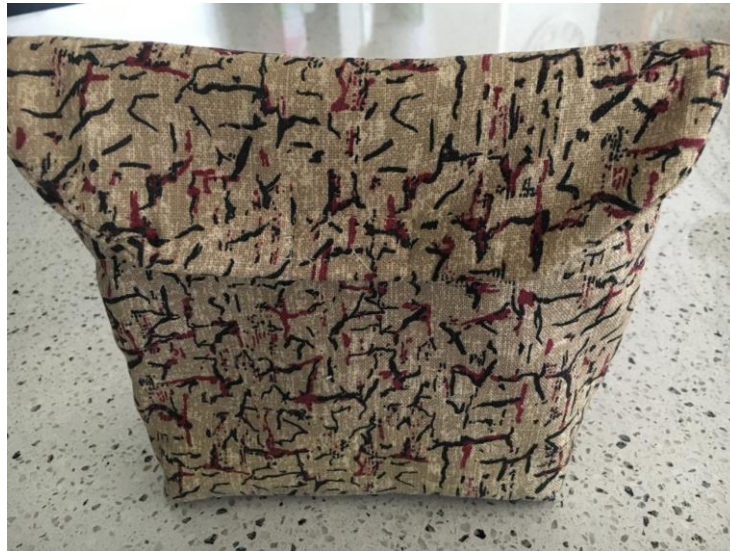
Little tote bag

Requirements--40 x10 inches fabric, 22x 10 inches wadding, 1 ½ inch Velcro's Construction Method.....Place wadding on wrong side of fabric