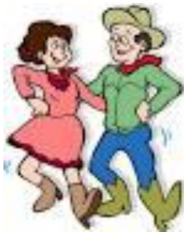
Country gear for Line Dancing