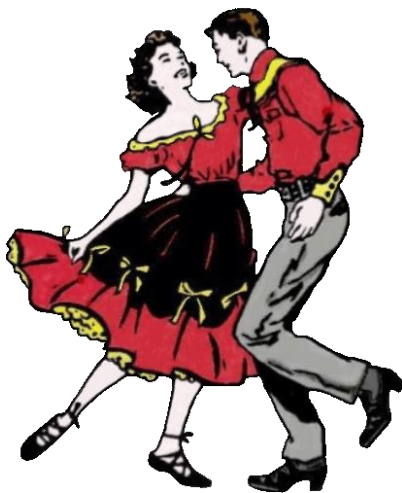
Square Dance outfits

Sat. Evening ....6pm for 6.30pm Start Of the Square, Line and Olde Tyme DANCE-ATHON !!!!.....Dress up for the Night!