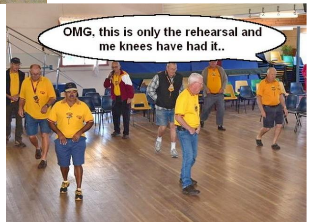
OMG, this is only the rehearsal and me knees have had it..