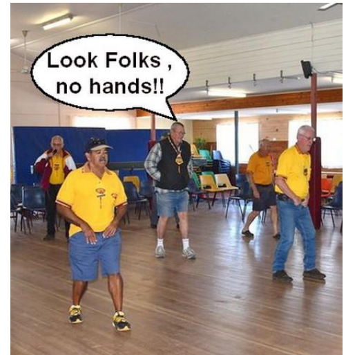
Look Folks , no hands!!