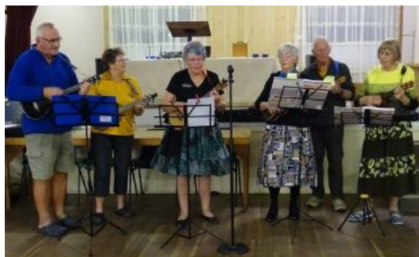
The night kicked off with a number from our own, QCC "Cluster of Pluckers" Ukulele Band.