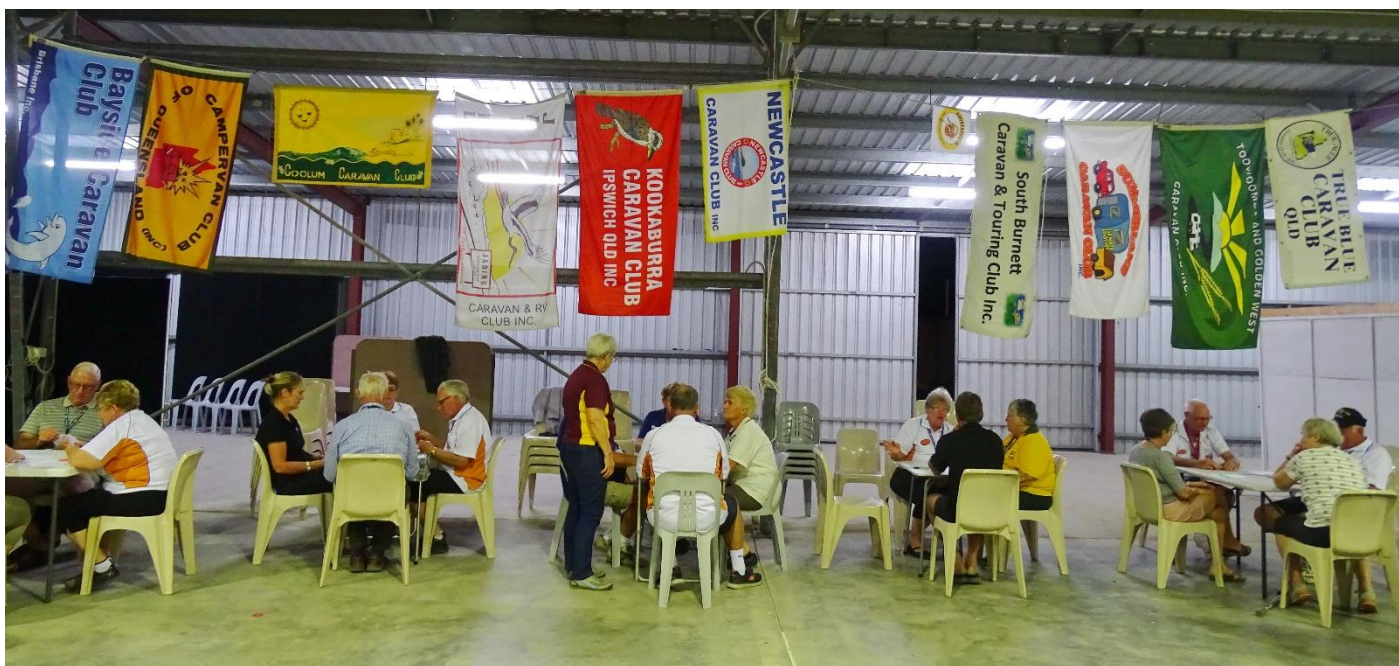
Views of all the attending Clubs Flags and some of the crazy Whist players!