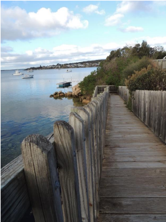
Left; Gail Lander's "Landscape or Seascape" category winning entry in the Photo comp.