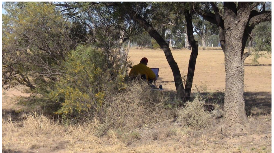
Below; The "Lone Uke Player " Practising Waltzing Matilda in peace and quiet.