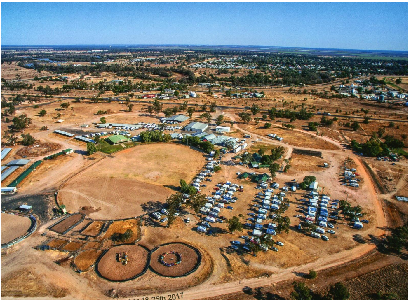
Official 40 th State Rally Photo taken from a Drone. Sept 18 th to 25 th 2017.