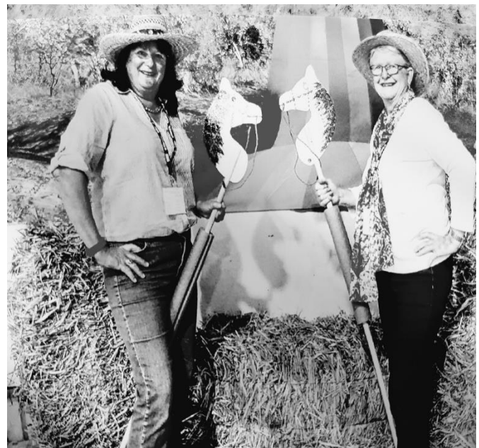
The Goondiwindi Greys