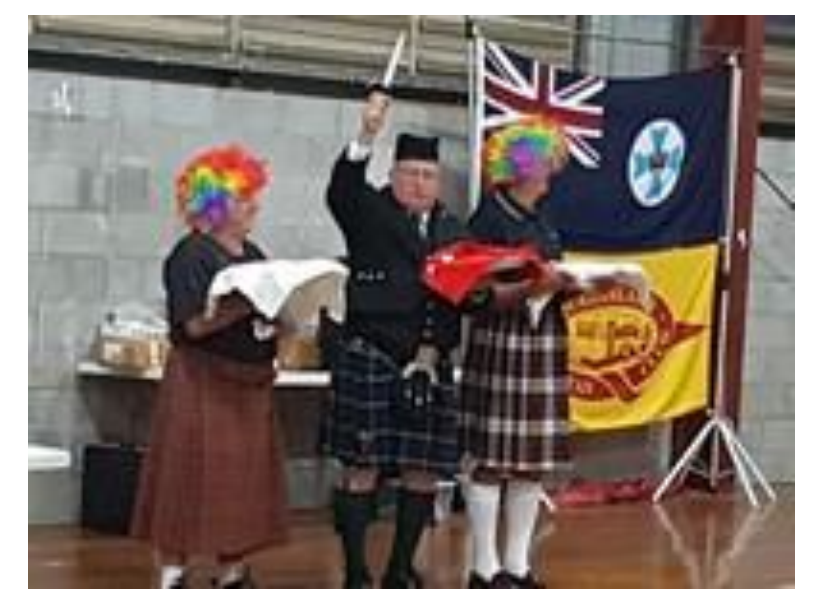
The Scottish Entertainer oversaw the Celtic tradition of "Introducing the Haggis" pictured below, which was enjoyed with a cuppa for supper