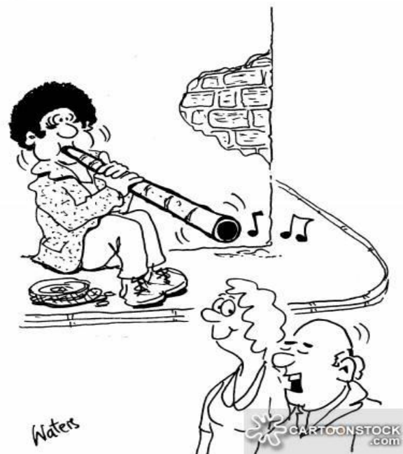
"He's playing 'Dancing Queen' on his didgeridoo... That must be an Abba-original!"