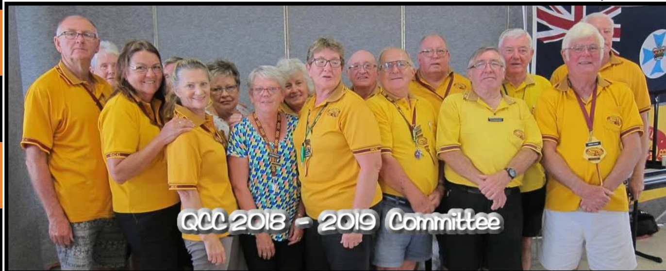
QCC 2018 - 2019 Committee