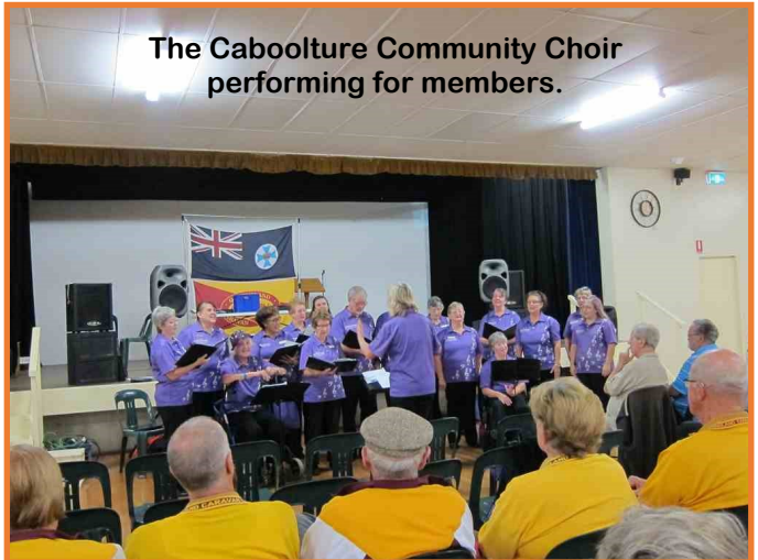
The Caboolture Community Choir performing for members.