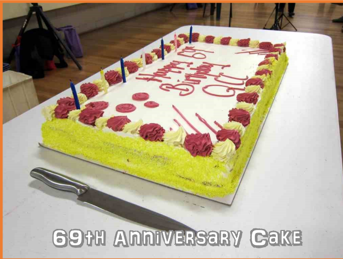
69th Anniversary Cake