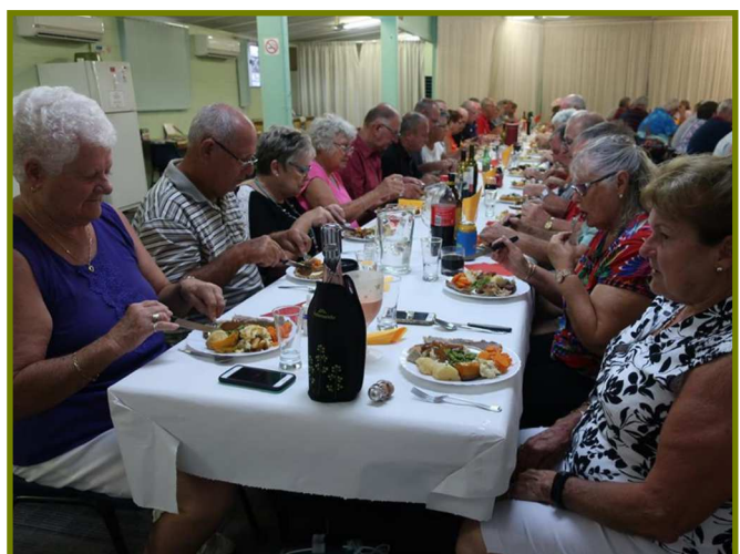
Members enjoying dinner provided by the Lowood Show Society.