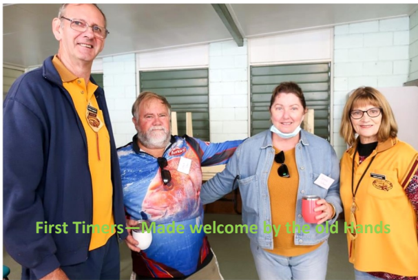
First Timers— Made welcome by the old Hands