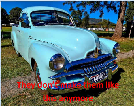
They don't make them like this anymore