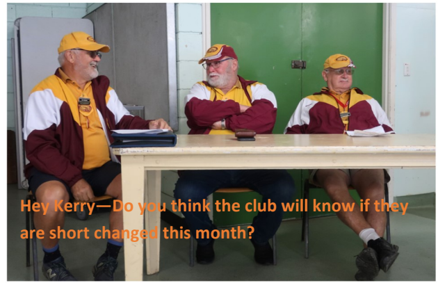
Hey Kerry—Do you think the club will know if they are short changed this month?