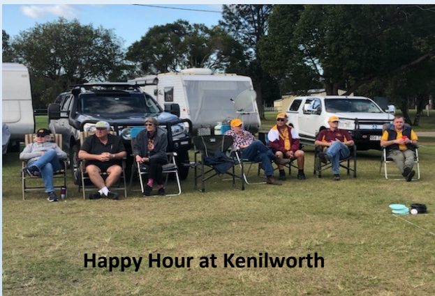
Happy Hour at Kenilworth