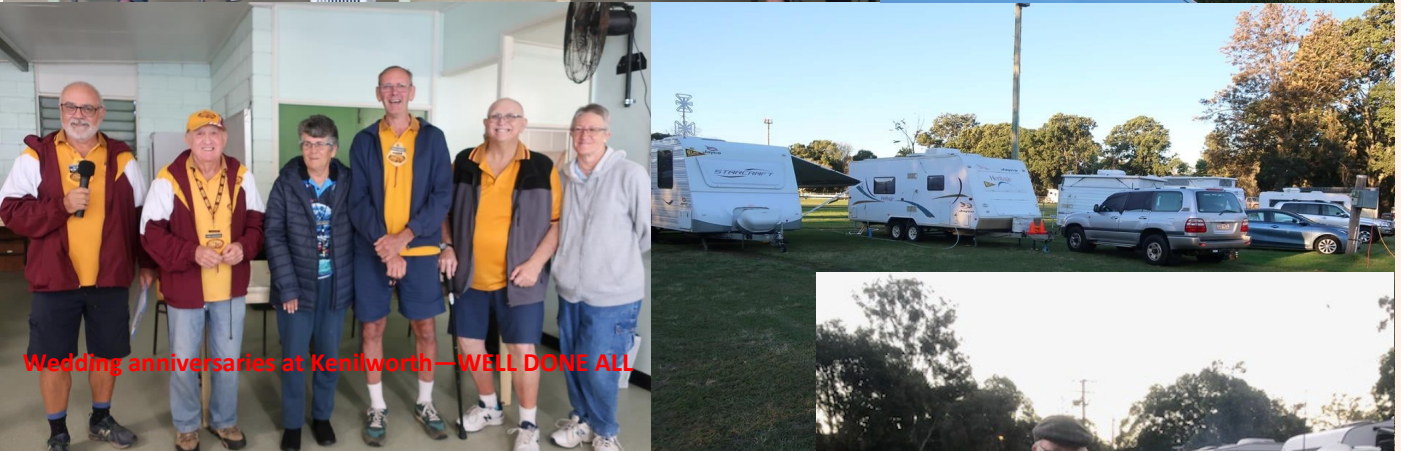
Wedding anniversaries at Kenilworth—WELL DONE ALL