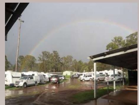
After the storm—A Double Rainbow to start Afresh