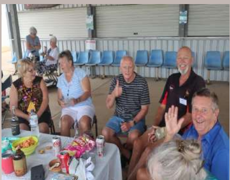
QCC Wanderer - Christmas Edition