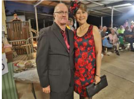
Dressed to kill - Blackbutt