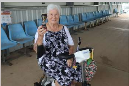
Carmel heard that there were no COPS in Blackbutt and started drink driving