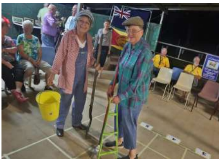
The POO Boys did an awesome job of keeping the track clean