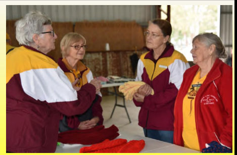
Some of the Car Boot Sale stalls, a fun afternoon enjoyed by all. Money made and some sales donated to the club charities