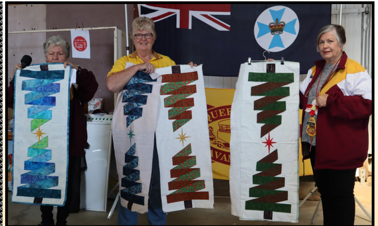
Finished Christmas table runner