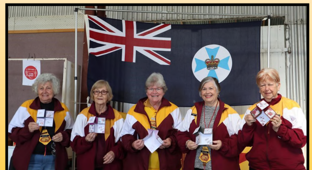
Card Making Class