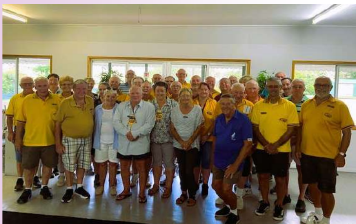
Kenilworth Bowls Club thanks QCC for their much needed Support

Kenilworth Lawn Bowls was enjoyed by all. 32 members participated in the games