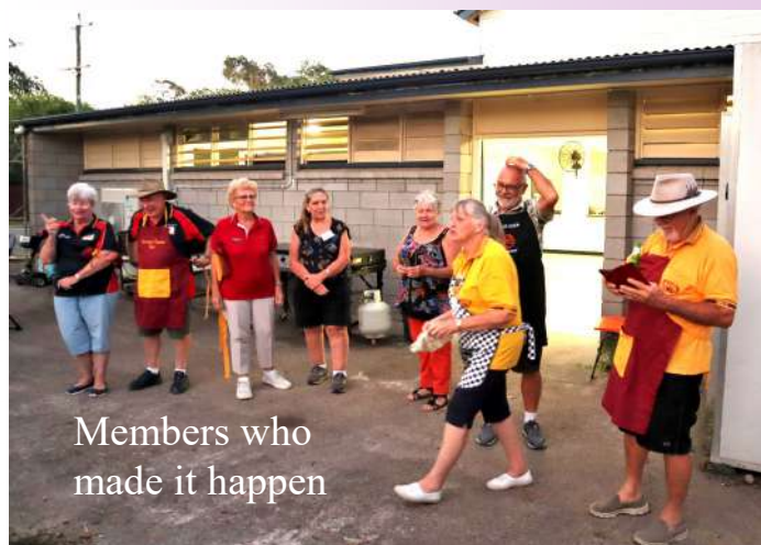
Members who made it happen