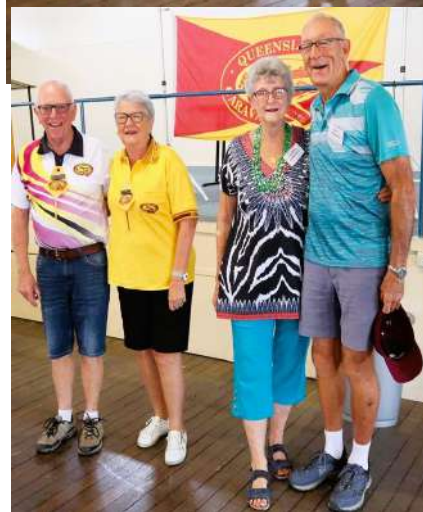
Celebrating in the month of March Birthdays (above) Anniversaries (Left)

Items are still being collected for QCWA