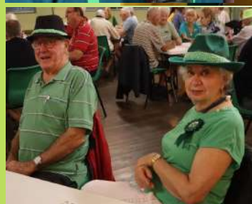
St Patrick's day at March Rally