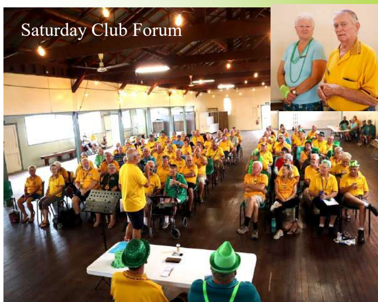
Saturday Club Forum