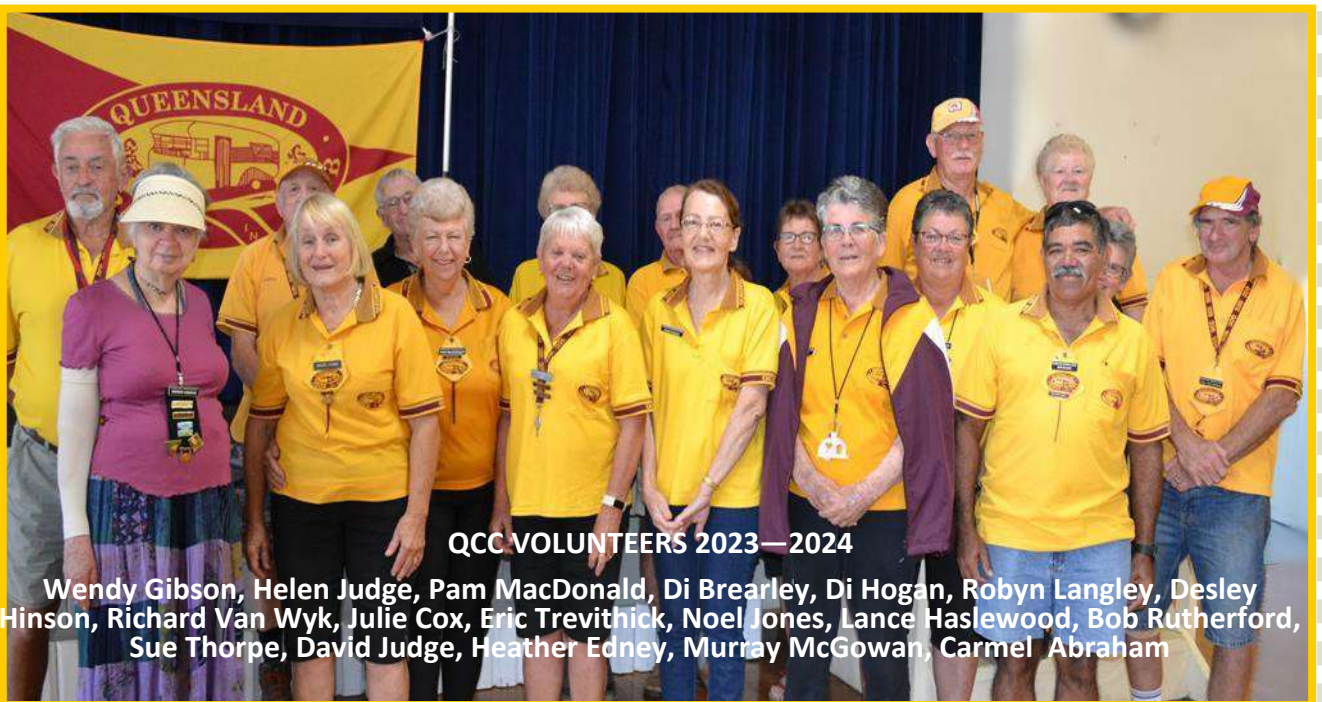
QCC VOLUNTEERS 2023—2024

THE OFFICIAL NEWSLETTER OF THE QUEENSLAND CARAVAN CLUB INC.