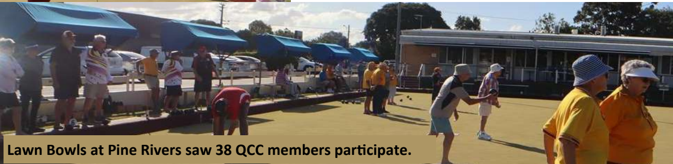
Lawn Bowls at Pine Rivers saw 38 QCC members participate.