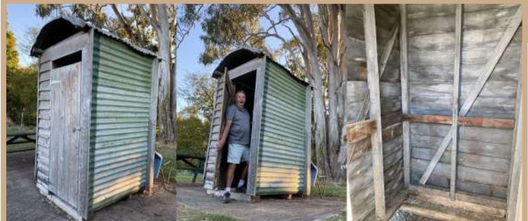
OKAY, SO I PAID A LITTLE EXTRA FOR MY ENSUITE.