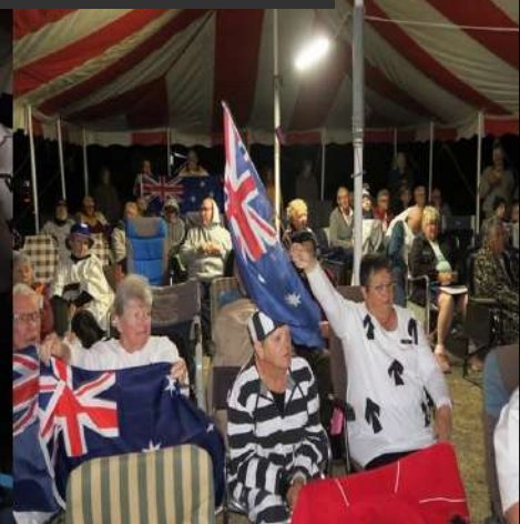
An amazing night of fun and games that involved much participation by the audience and enhanced by the creativity of all involved, especially those that came in costume.