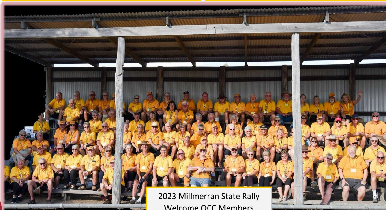
2023 Millmerran State Rally Welcome QCC Members