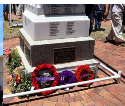
REMEMBRANCE DAY 2023 IN NANANGO SUPPORTED BY QCC