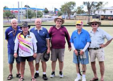
30 Club members participated in Lawn Bowls at Nanango. The Lawn Bowls Club says Thank You