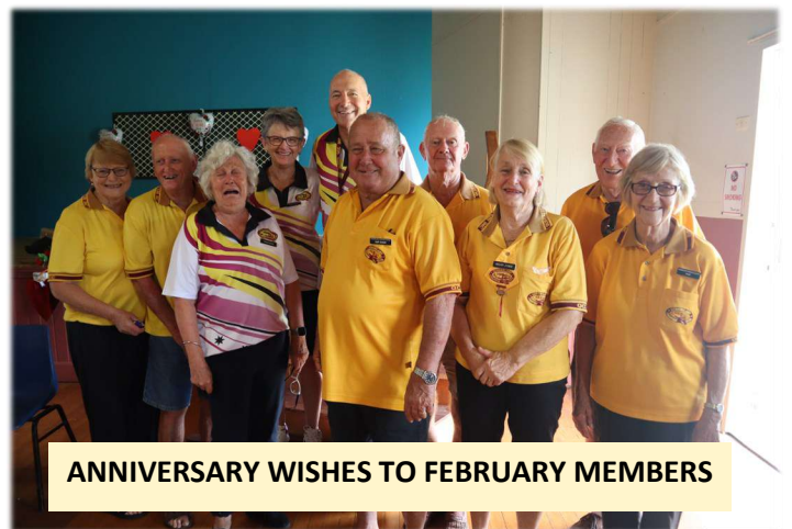
ANNIVERSARY WISHES TO FEBRUARY MEMBERS