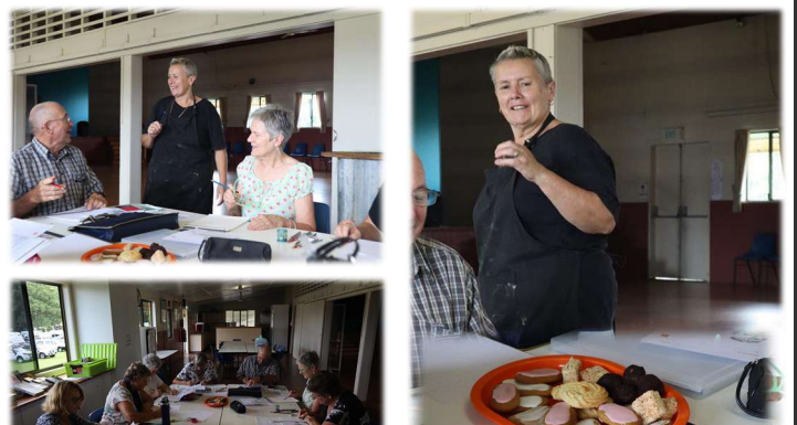
SPECIAL TREAT AT ART CLASS FROM CATERER IN IMBIL