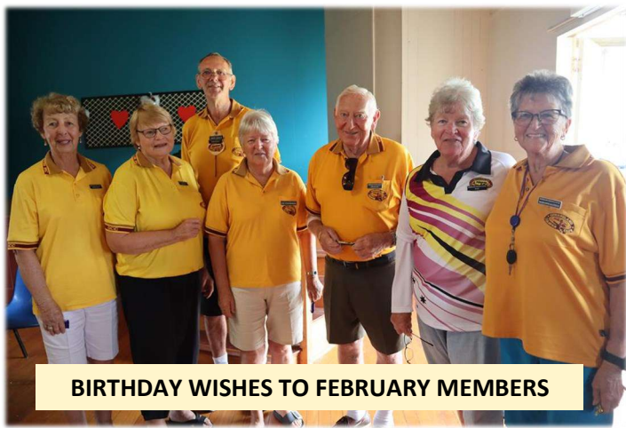
BIRTHDAY WISHES TO FEBRUARY MEMBERS