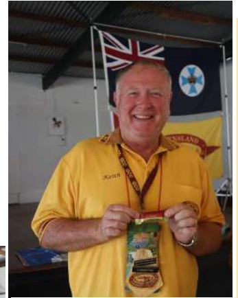
NOVEMBER BIRTHDAY BOY RECEIVING HIS CHOCOLATE