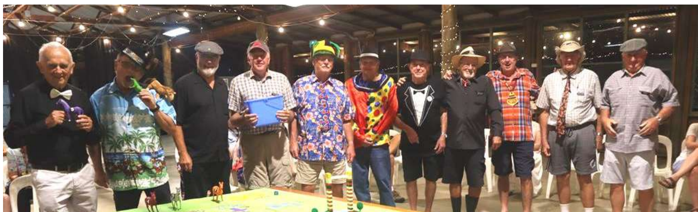
THE MALE FASHIONS ON THE FIELD. WHAT A HANDSOME LOT.