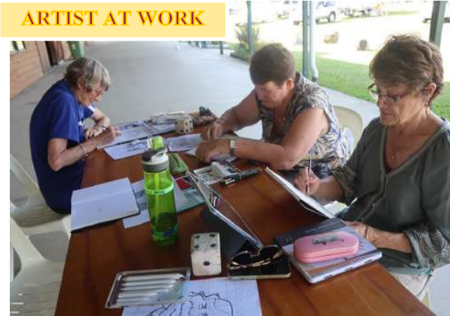
ARTIST AT WORK