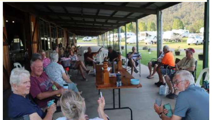
MEMBERS CATCHING THE BREEZE AT HAPPY HOUR