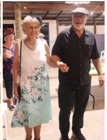
SATURDAY NIGHT AT THE RACES