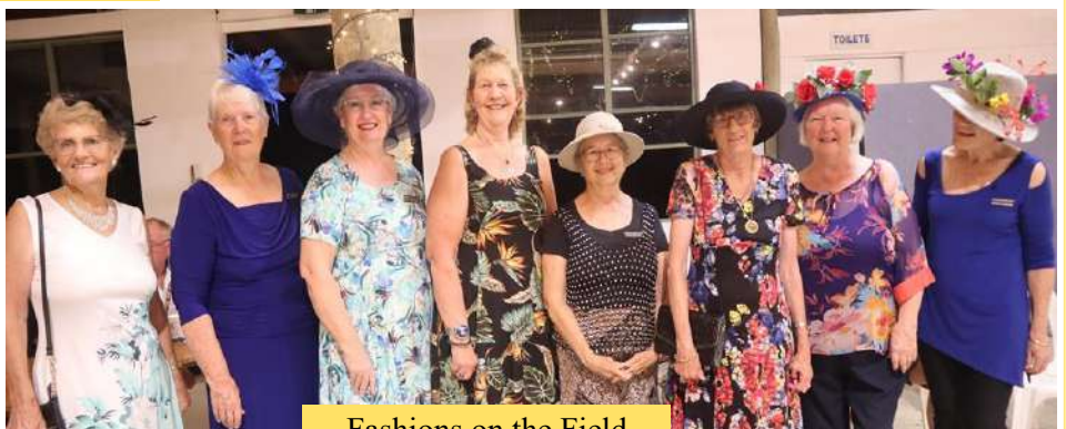
Fashions on the Field