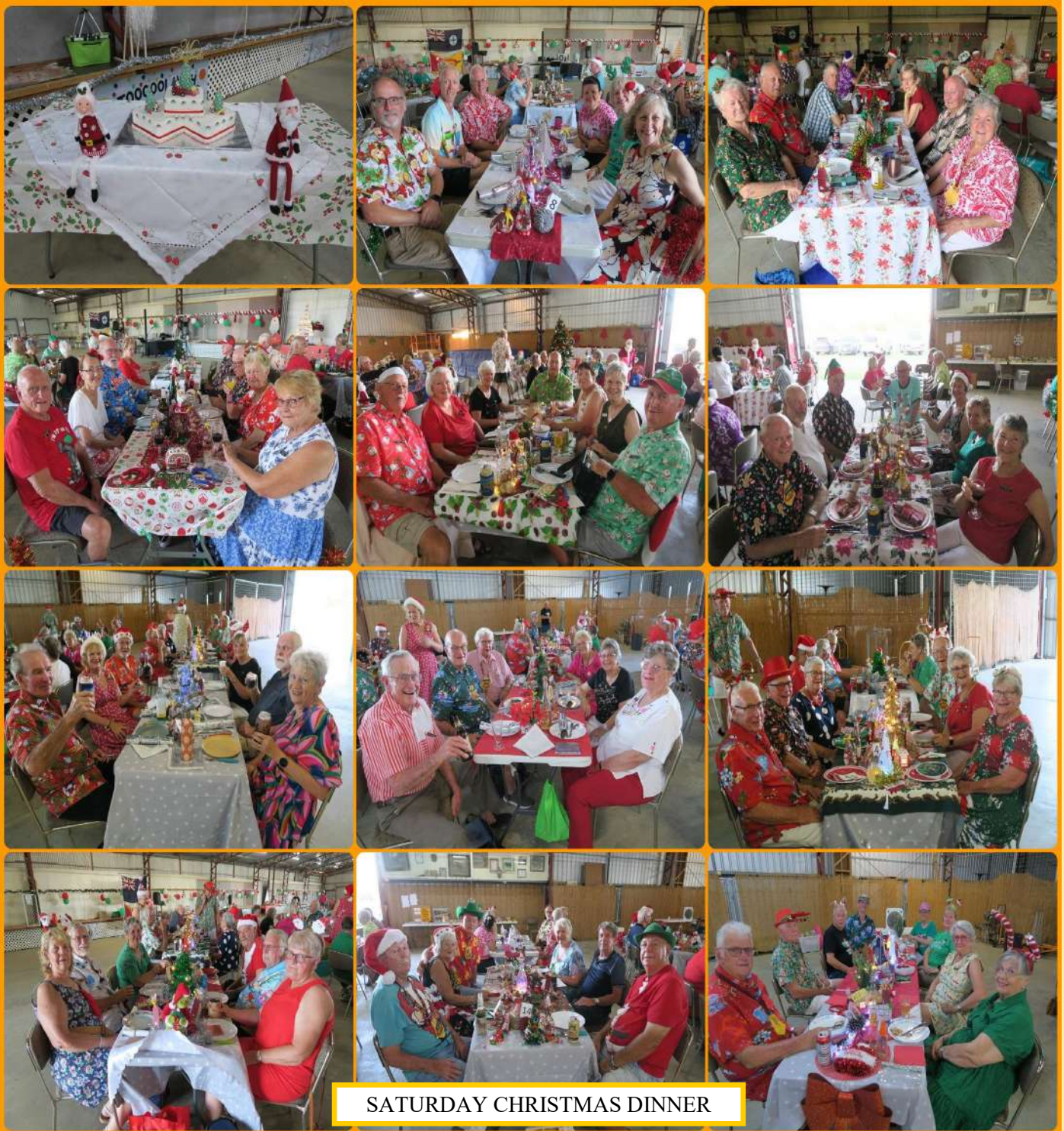
SATURDAY CHRISTMAS DINNER