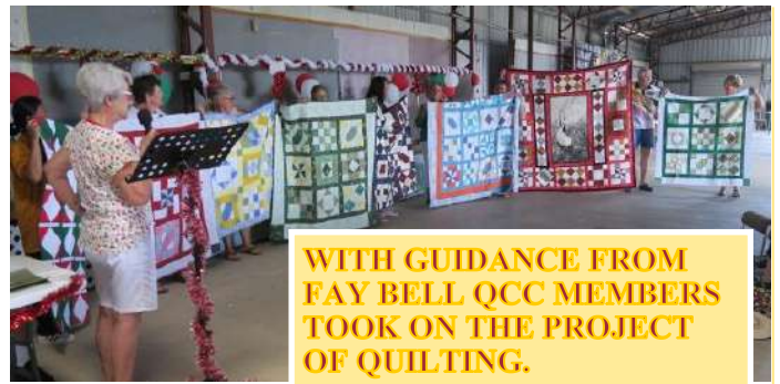
WITH GUIDANCE FROM FAY BELL QCC MEMBERS TOOK ON THE PROJECT OF QUILTING.