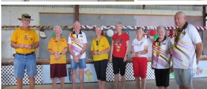
MEMBERS WITH DECEMBER BIRTHDAYS